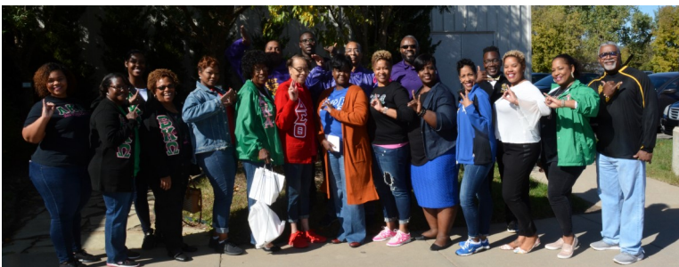
Before COVID, members from the Kansas Sisters and Brothers for Healthy Infants during a spring meeting.