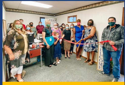
The new KFAN office in Coffeyville, Kansas.

We believe every family deserves the chance to be empowered with the knowledge & tools they need to advocate