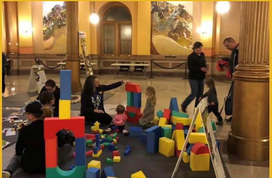
TOP: Parents work with their children on developmental skills after guidance by parent-educators. BOTTOM: KPATA at the 2018 Block Fest at the Topeka Capitol.