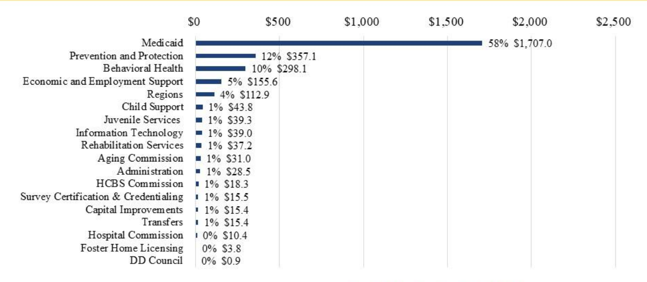
Total Budget = $2,929.1 m