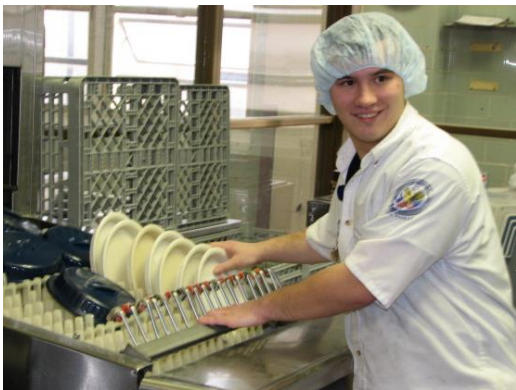
Among the jobs achieved by VR consumers are over-the-road truck driver, retail business operator, social worker and food service worker. A VR counselor can help you identify a job that is good match for your skills and interests.

If you are eligible for services, a counselor will assist you in developing a specific, comprehensive plan to help you get a job. You may also work on developing this plan on your own or with the assistance of another individual who is willing to help you. This plan will outline the type of job you plan to achieve, the services you will receive, your rights, and your responsibilities.